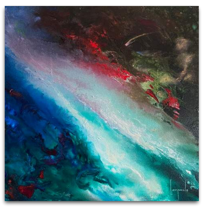
Time Lapse 12 x 12 in. | Acrylic on Canvas | <u>Available</u>