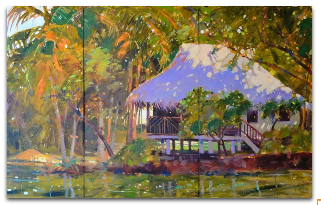
Tropical Paradise Size: 60 x 108 in. | AVAILABLE