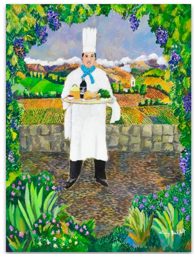
Delices de la Vallee