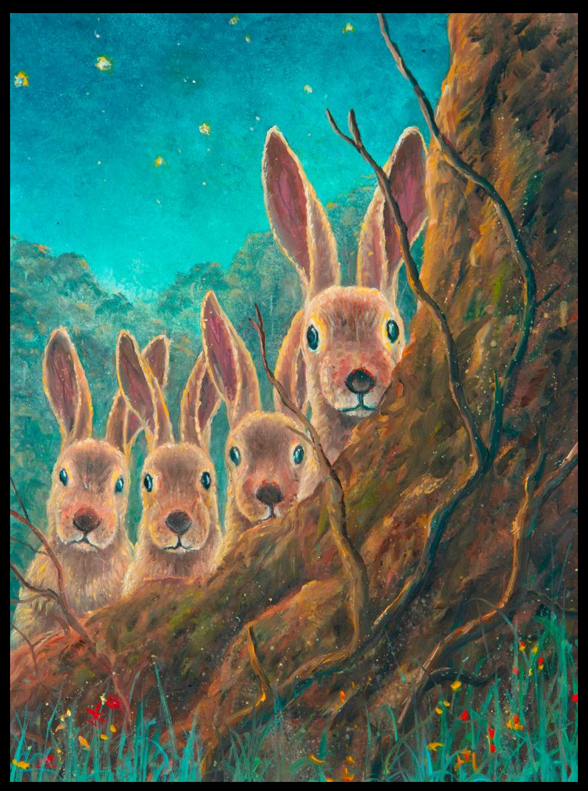
The Four 16 x 12 in. Oil on Wood

To view more art in oil by Robert Bissell CLICK HERE