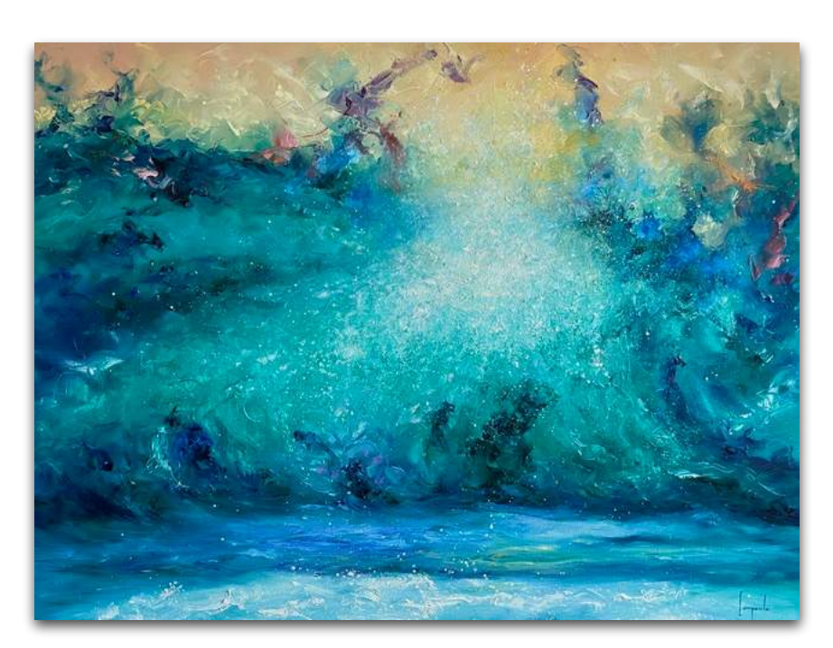
Uplift 30 x 40 in. | Oil on Canvas | <u>Available</u>