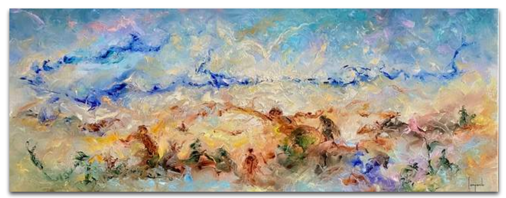
In the Flow

16 x 40 in. | Oil on Canvas | <u>Available</u>