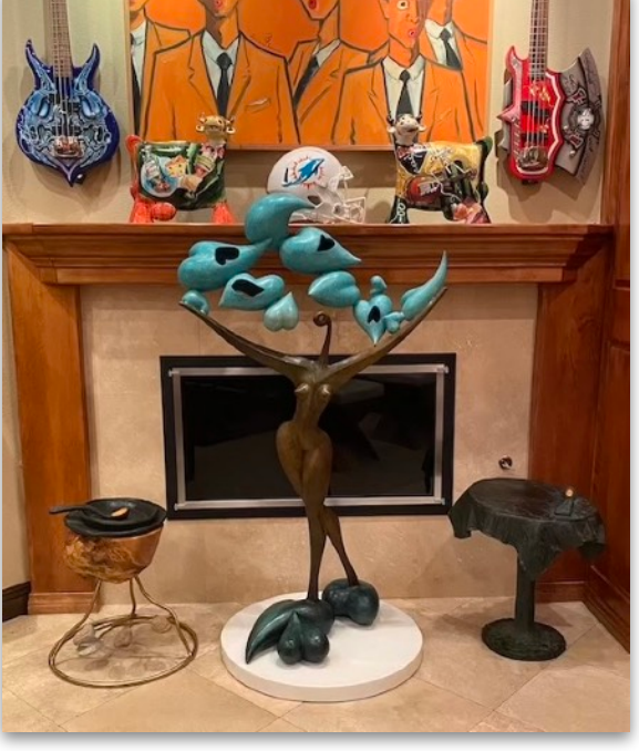
All You Need Is Love