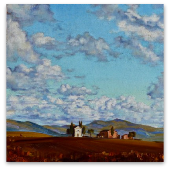
Somewhere In Time | Oil | 12 x 12 in.