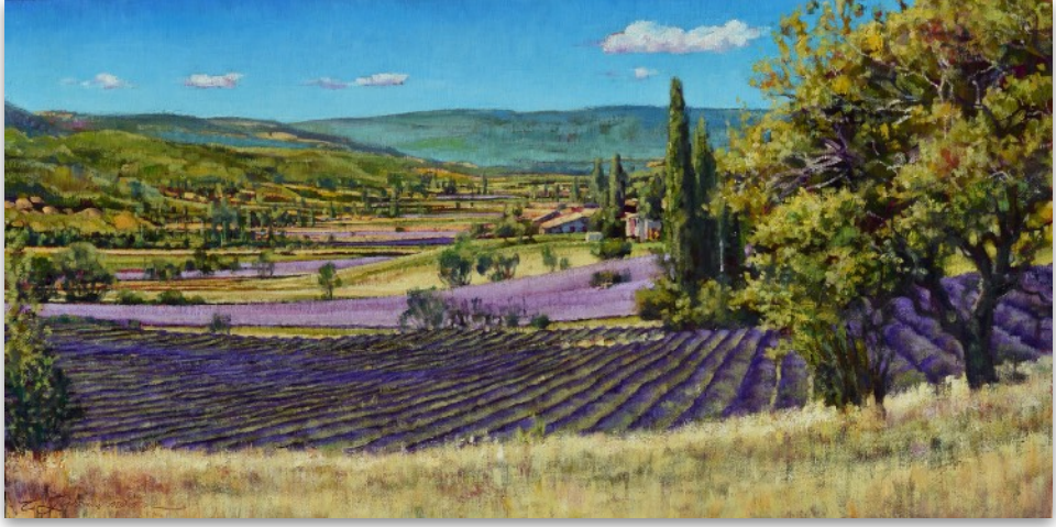
Shades of Lavender, Provence | Oil | 12 x 24 in.