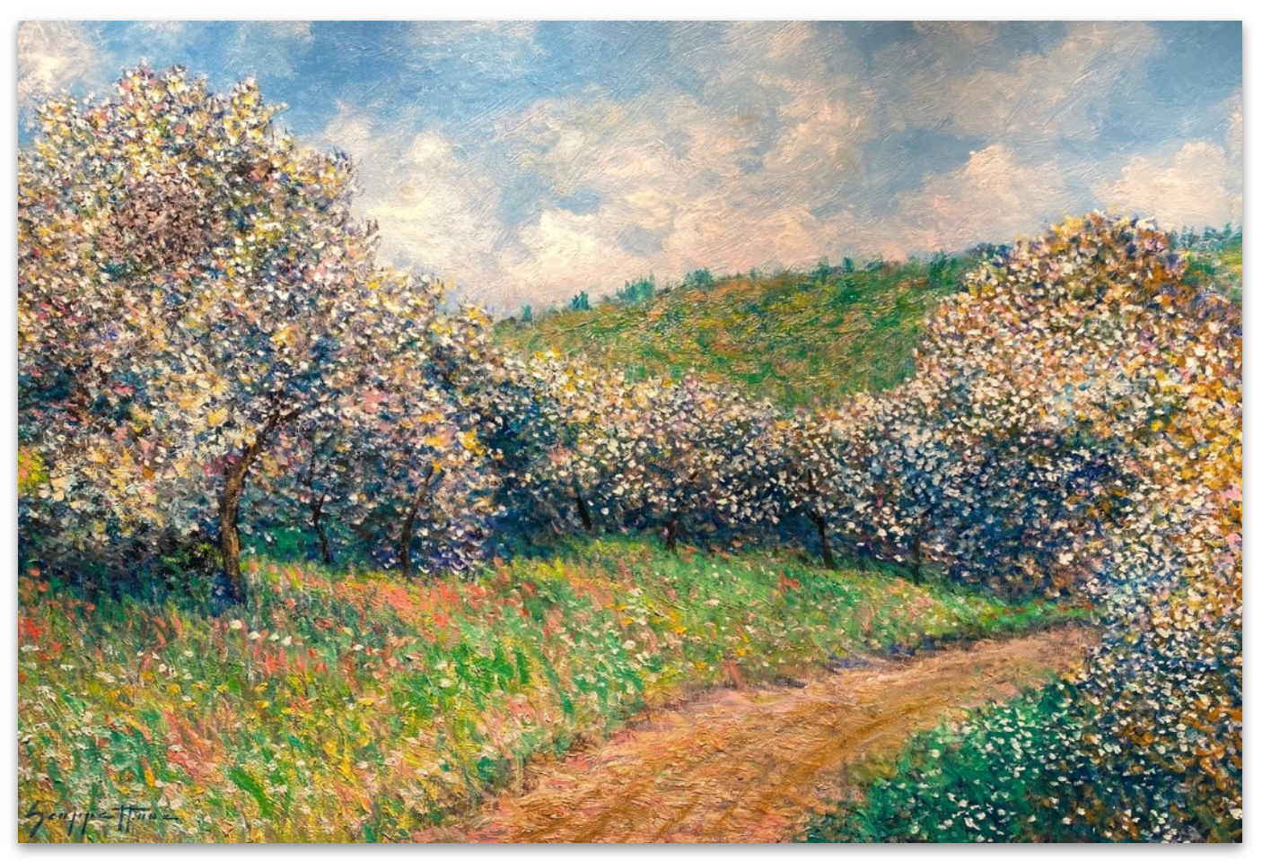
Highland Blossoms, Buckland | Oil 24 x 36 in.

This exhilarating scene of the blossoming trees along the road from South Deerfield to Buckland, Massachusetts, is one that represents miles of newly grated country roads, that we still enjoy today all across the United States.