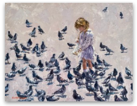
Lunchtime | Oil | 11 x 14 in.