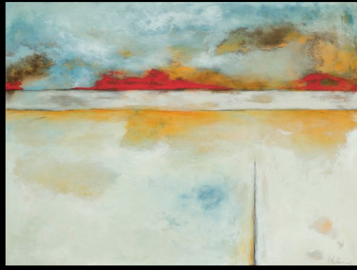
Reverberation of Light Acrylic and Clay | 30 x 40 in.