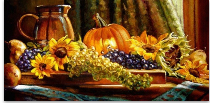
Harvest of Color | Oil | 14 x 28 in.