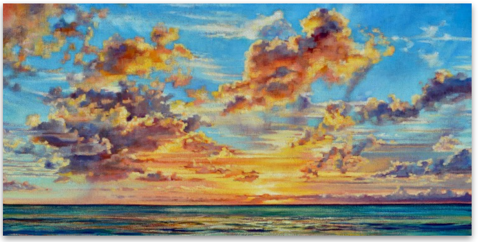
Solstice Sunset | Oil | 12 x 24 in.