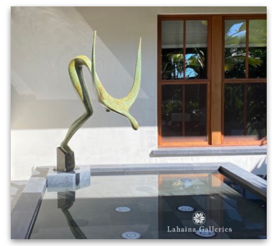
Jumping Into the Water