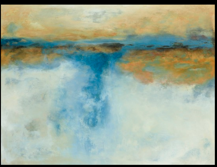
Far Reaches Acrylic and Clay | 30 x 40 in.