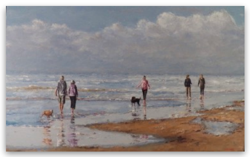
Crisp Winter Day | Oil | 30 x 48 in.