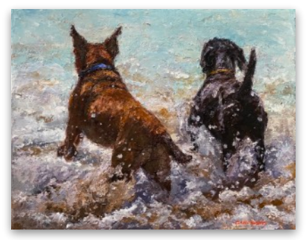
Exuberance | Oil | 11 x 14 in.