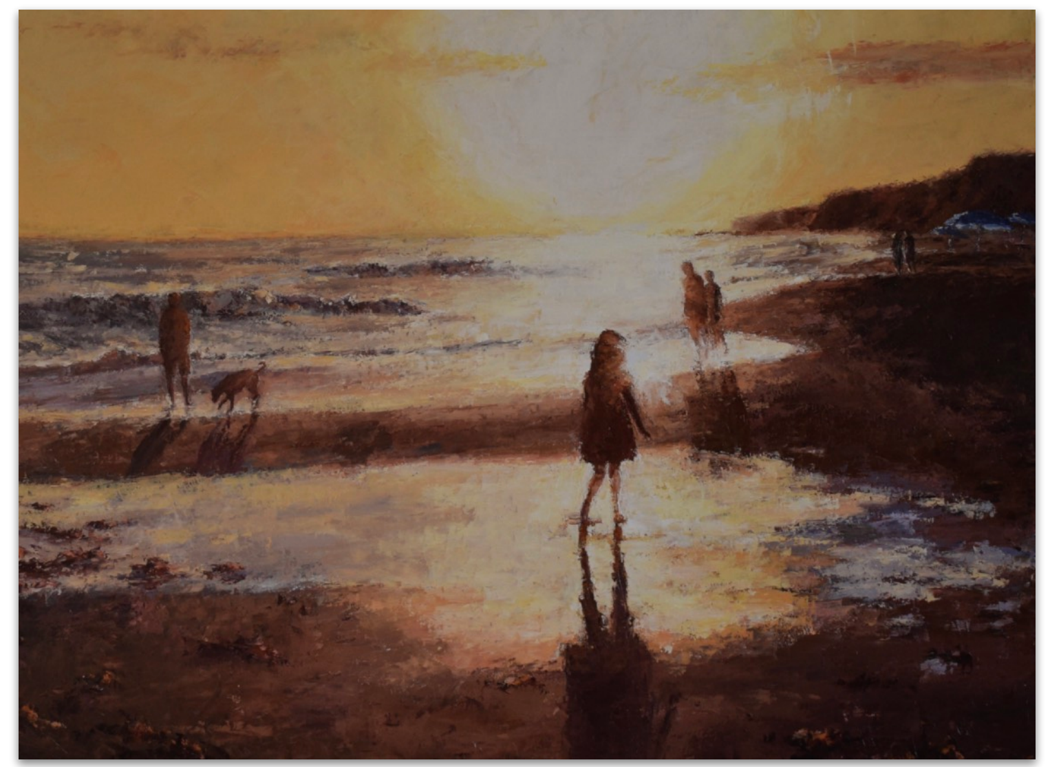
Crystal Cove Sunset | Oil | 30 x 40 in.